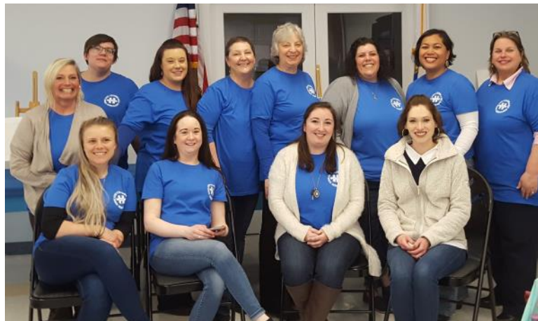
Some of the hardworking ACBC members during Autism Awareness Month!

Visit their website at https://www.dlc-ma.org/ for more information. We will use the remaining time of our meeting to recap this year of ACBC events, discuss ACBC's direction for next year, and solicit ideas from participants on topics, presenters, and venues for next year. Please bring ideas! The meeting will be held at the BC Arc Training Room, 877 South Street, 3rd Floor Pittsfield, 10:00 a.m.-12:00 p.m. on June 21.