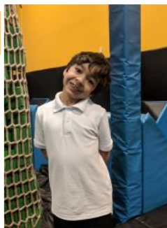
Family Event at Bounce! Trampoline Sports

April was a very full month of activities related to awareness, acceptance, advocacy, and fun! Here are some participants enjoying the events!