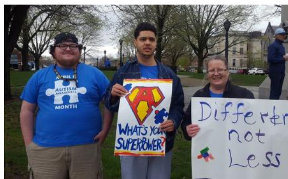
Rally in Pittsfield