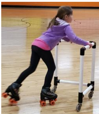
Interskate Family Event