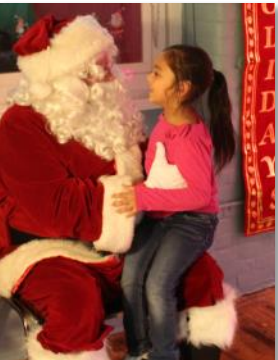
Santa and friend at last year's party

"Oh the weather outside is frightful... " But our Holiday Party will be delightful!