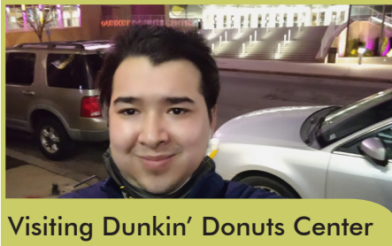
Visiting Dunkin' Donuts Center