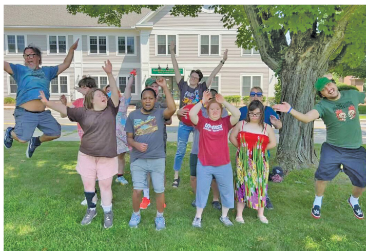
Milestones Day jumps for joy at the Eagle family's gift

Get early bird tickets for The Bash at Pathlight.life/thebashtickets and stay tuned for information on other events to celebrate two decades of inclusion and friendship.